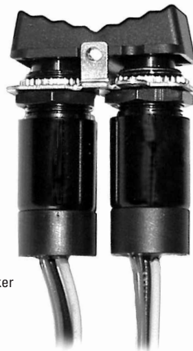
HPL-R Hall Effect Rocker