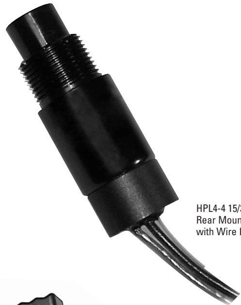
HPL4-4 15/32" Thread Rear Mount shown with Wire Leads