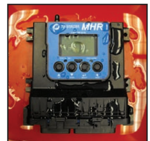
Rugged waterproof design